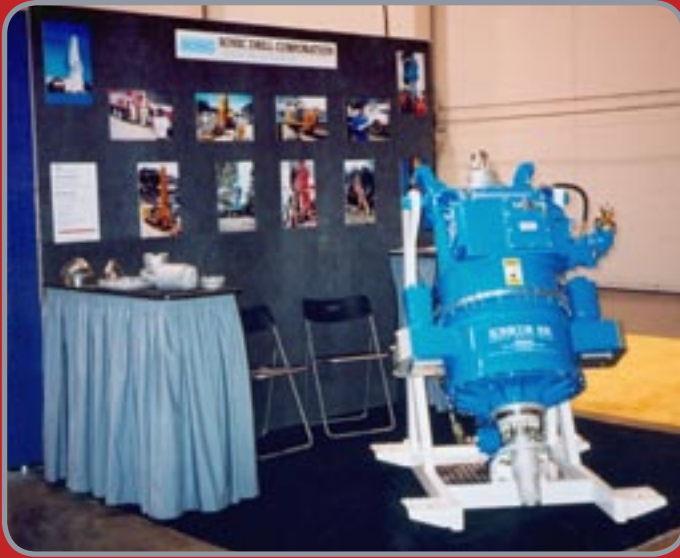
■ The modern sonic drill head can handle a variety of drilling applications.