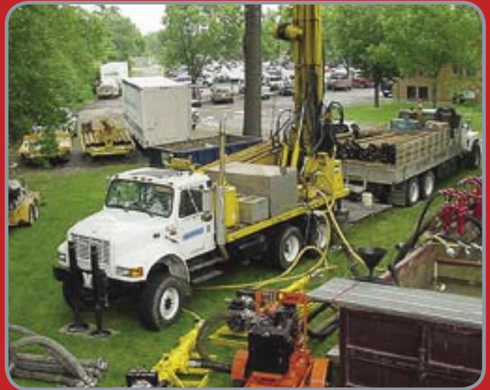
■ Preparation for large diameter multi-cased deep environmental exploration in artesian conditions.