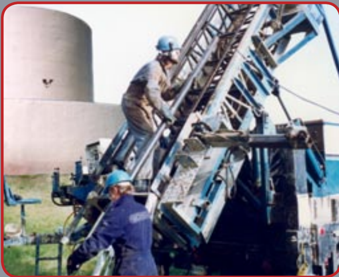
■ Angle drilling for the installation of cathodic protection anodes under a liquid natural gas steel storage tank.