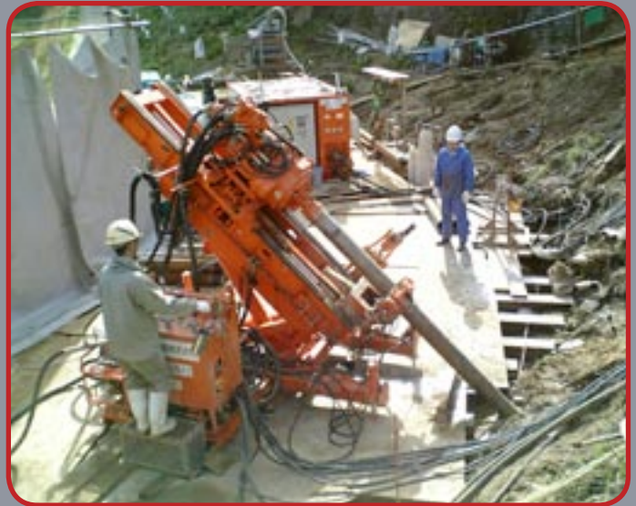
■ Installing anchors for landslide prevention.