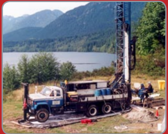
■ Installing piezometers to monitor seepage from a drinking water reservoir.