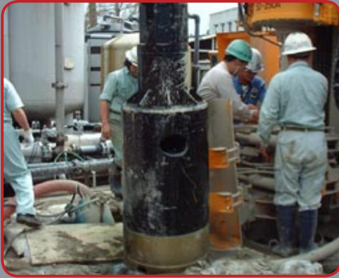
■ Drilling for the installation of a large diameter dewatering well.