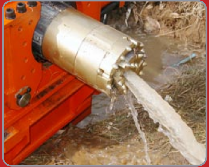
■ Typical sonic drill bit.