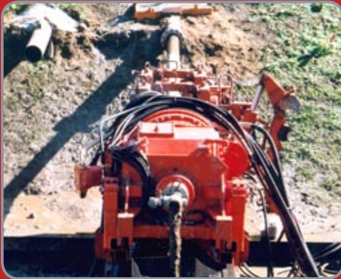
■ Horizontal continuous core drilling, with reverse circulation, for tunnel pre-boring assessment.