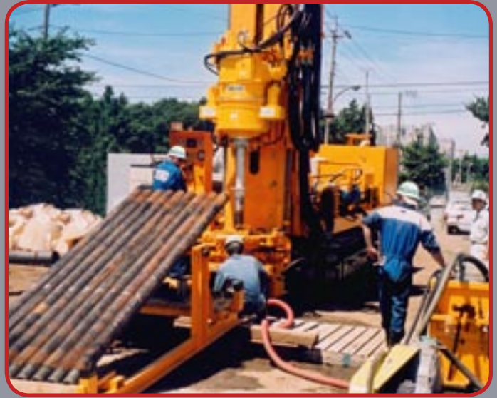
■ Injecting grout for soil stability improvement project.