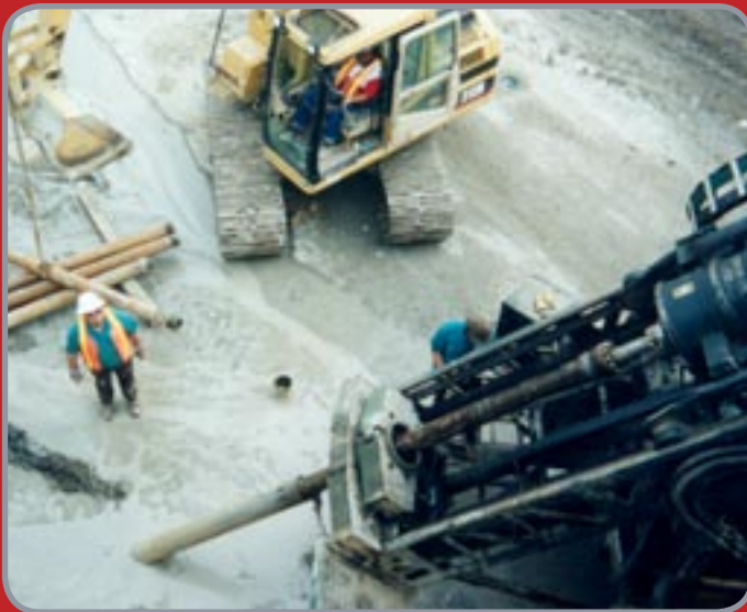
■ Injecting grout in old mine workings to prevent subsidence of above ground structures.