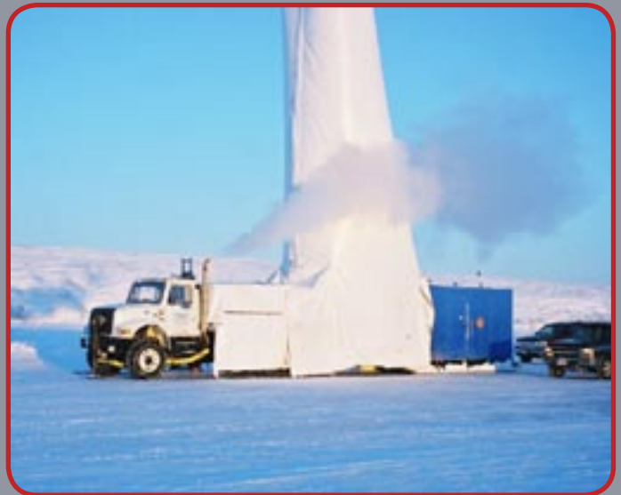
■ Drilling for the placement of seismic explosives for oil and gas exploration.